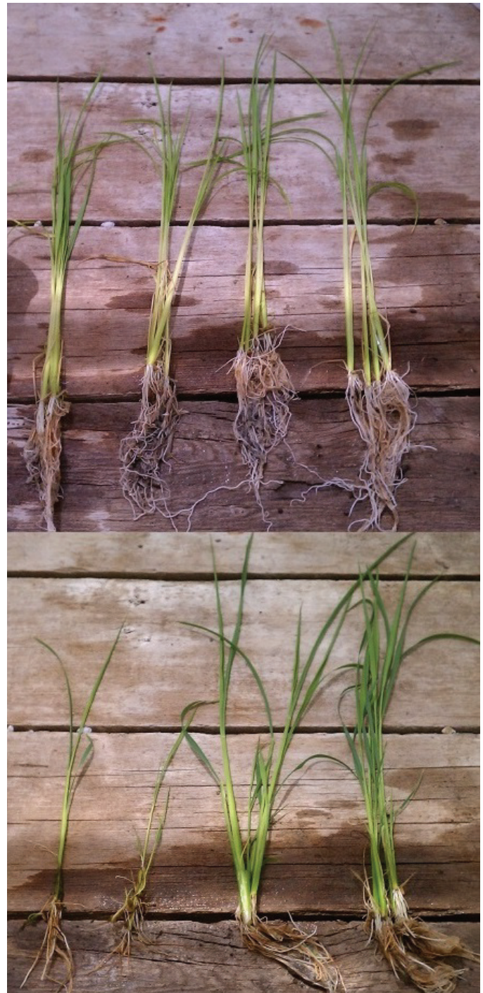
Fig. 1. Rice water weevil plant damage from greenhouse study. Top picture shows undamaged root systems. Bottom picture shows the diagnostic root pruning by rice water weevil larvae.

Adult Stage. The adults are only 4 mm long upon emergence with a light brown coloration and sometimes have a dark spot running the length of the elytra (Fig. 3, Jiang et al. 2006, Flint et al. 2013). The adult has two adaptations that confer an ability to lead an aquatic