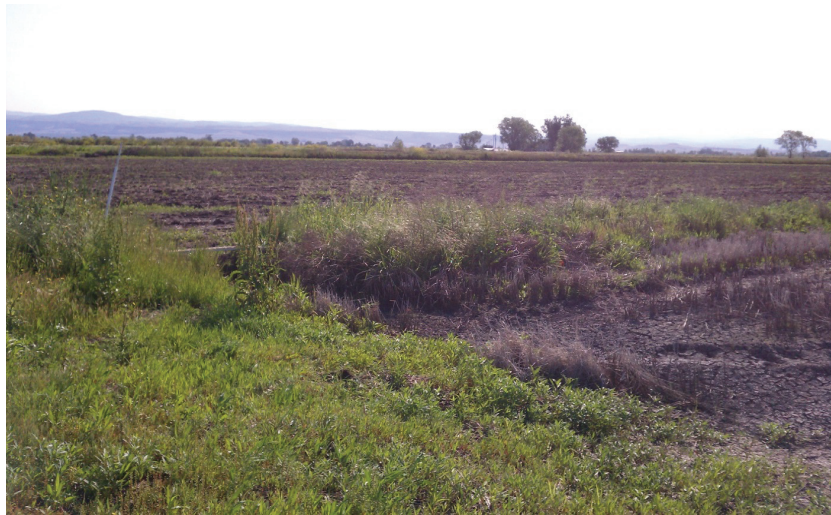
Fig. 4. Levees with an abundance of weeds in early spring provide rice water weevil adults ample resources for regeneration of flight muscles and ovary development. A common sight around rice fields in the Northern Sacramento Valley in early March.

flooded soil and the availability of an appropriate food source. It was found that flight from unflooded and flooded habitats without rice was higher when compared with flooded habitats with rice. It was suggested that the presence of rice in a flooded habitat was important in arresting weevil flight (Palrang and Grigarick 1993). If they have flown, then the adult indirect flight muscles will degenerate within 5–7 d of landing (Haizlip 1979, Lorenz and Hardke 2013). Once fields are flooded, the adults swim out into the edges of the flooded paddy (Stout et al. 2002b, Flint et al. 2013). They will typically clump in areas adjacent to the levee and feed within several meters of the edge of the field (Sooksai and Tugwell 1978, Espino 2012). It was found that these adult populations peaked after flooding, which coincided with an increase in the number of leaf feeding scars (Muda et al. 1981).