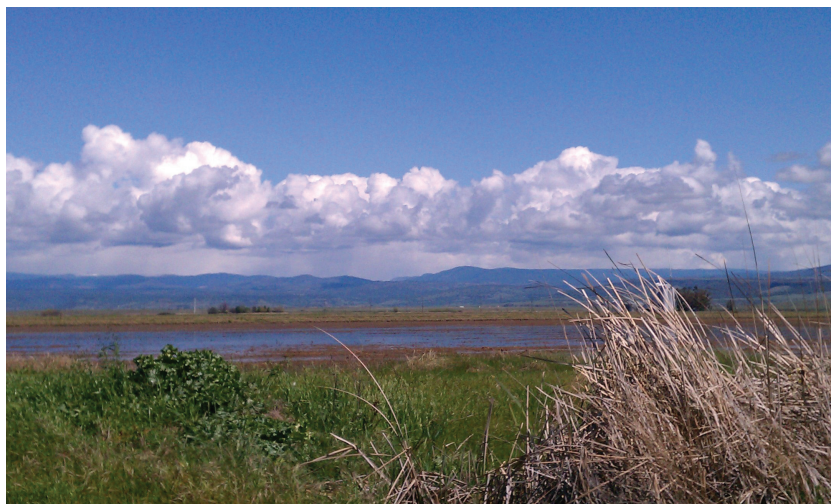
Fig. 6. A harvested field that is being flooded for the winter in the Northern Sacramento Valley. A common practice by growers when water availability is not an issue.

response between different production areas may be related to variation between rice varieties and the environmental conditions. This type of cultural control is impacted by the plant development as well as the pest population dynamics. In southern U.S. rice production, early planting has become an important tactic for avoidance of heavy infestations because weevil emergence from overwintering sites is not yet complete. By planting early, the grower is faced with a lighter weevil infestation that can be more easily managed with insecticides and therefore minimize yield losses compared with planting later in the season (Rice et al. 1999, Stout et al. 2011).