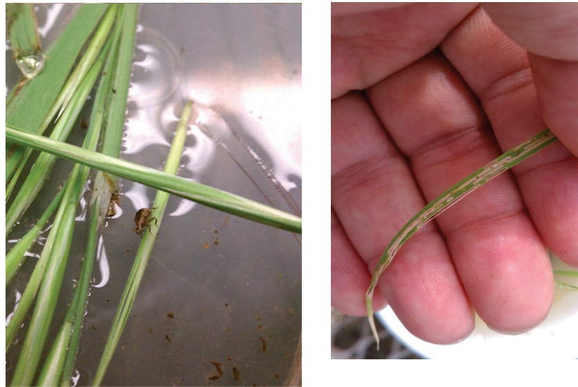
Fig. 3. Rice water weevil adult feeding on Bromus spp. leaves in the laboratory at UC Davis and the resulting damage on the rice leaf blade showing diagnostic longitudinal feeding scars by rice water weevil adults.

China, adults will go through additional generations because of the longer growing season and multiple crop cycles (Ingram and Douglas 1930, Chen et al. 2005).