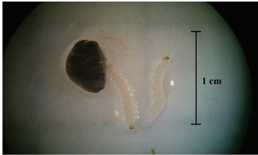
Fig. 2. Rice water weevil pupa and two larvae shown side by side for size comparison. Viewed at 60 \times magnification.